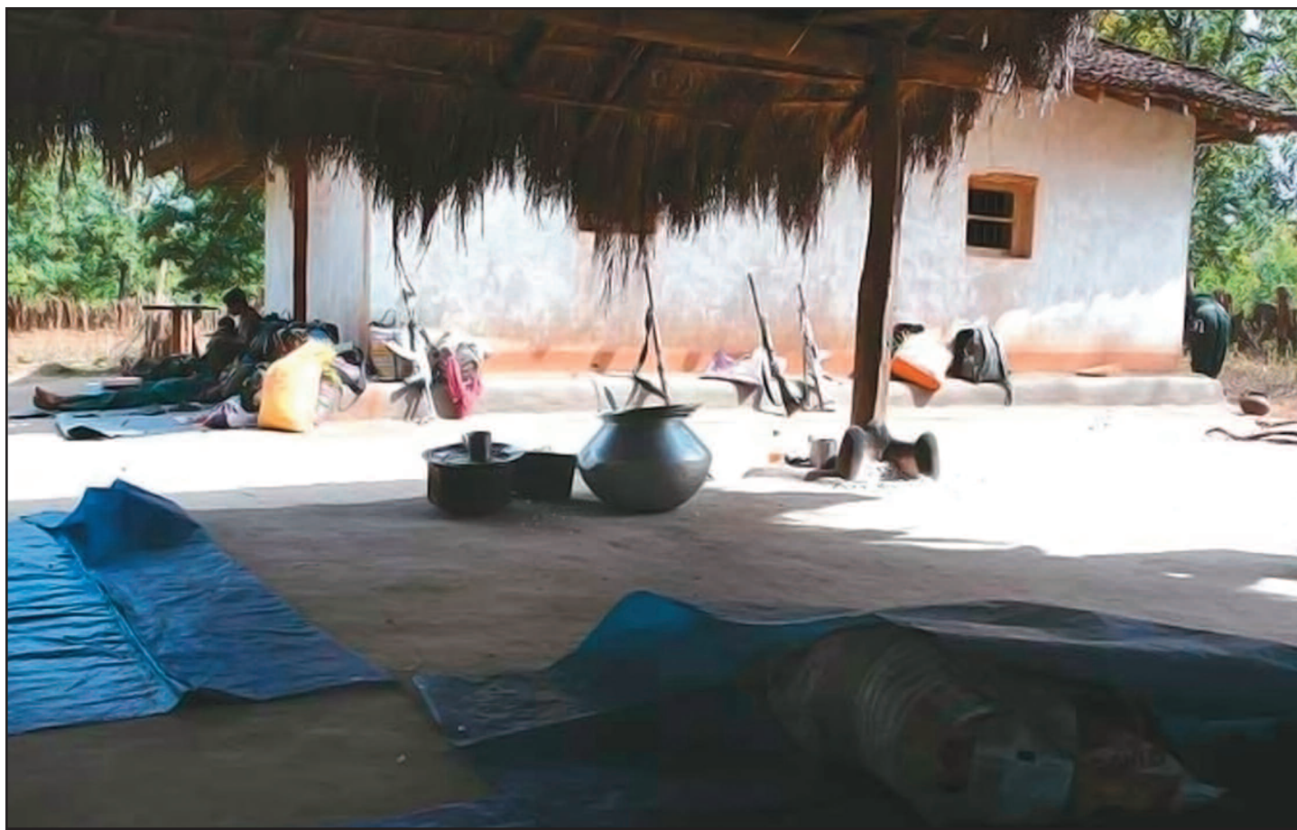
Spare Beauty: Pots, rifles, jhillies... Everything in these villages is clean and necessary

dressed, in 'civil' (Gondi for 'civilian clothes') as opposed to 'dress' (the Maoist 'uniform') and could pass off as a young executive. I ask him why no uniform. He says he's been travelling and has just come back from the Keshkal ghats near Kanker. There are reports of 3 million tonnes of bauxite that a company called Vedanta has its eye on.