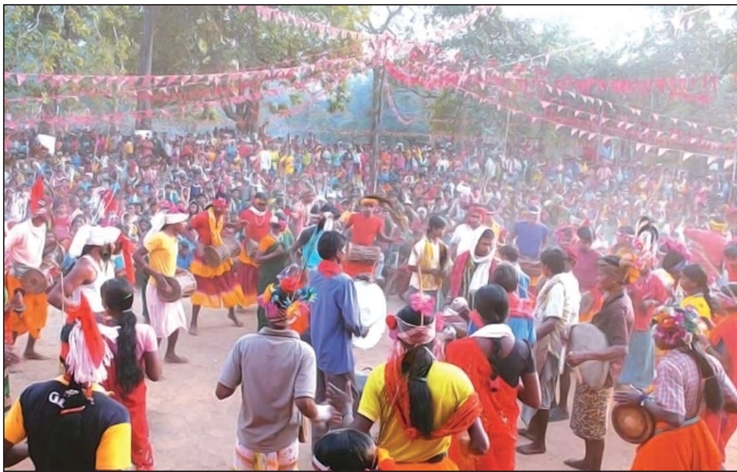
Gathered Storm: Dance troupes of various Janatana Sarkars perform on Bhumkal Day