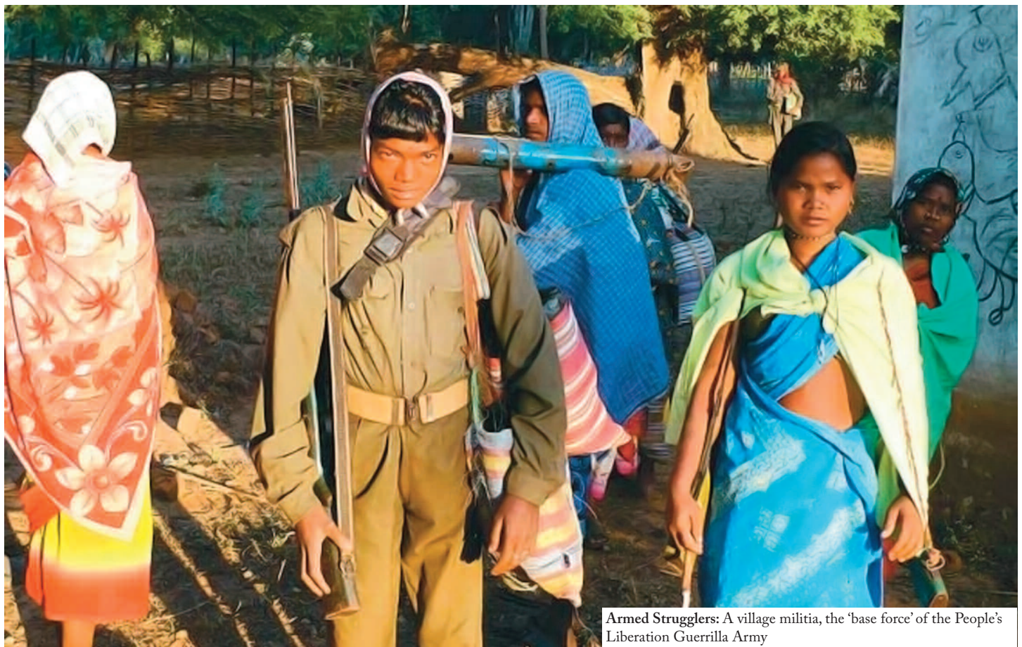
Armed Strugglers: A village militia, the 'base force' of the People's Liberation Guerrilla Army