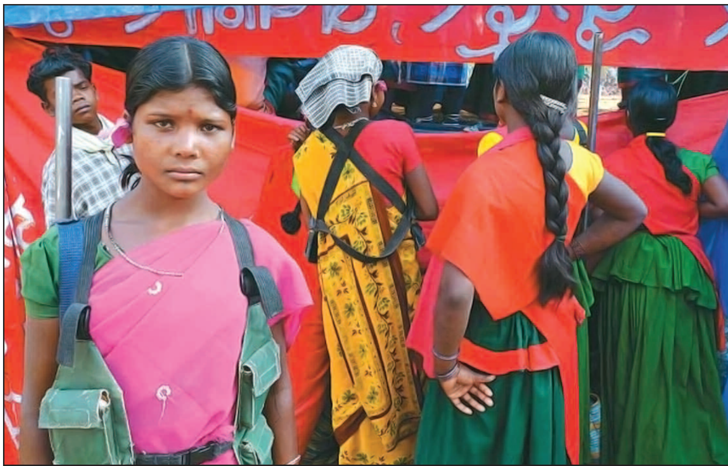
The Day of the Bhumkal: Face to face with "India's greatest Security Threat".

nounced that even SPOs could return if they genuinely, and publicly, regretted their actions. Young people began to flock to the PLGA. (The PLGA had been formally constituted in December 2000. Over the last 30 years, its armed squads had very gradually expanded into sections, sections had grown into platoons, and platoons into companies. But after the Salwa Judum's depredations, the PLGA was rapidly able to declare battalion strength.)