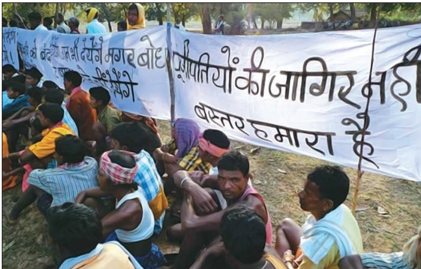
Staying Put: People of Kudur village protest the Bodhghat dam: 'It does not belong to the capitalists, Bastar is Ours'

Gadchiroli. Comrade Venu describes those first months in some detail: how the villagers were suspicious of them, and wouldn't let them into their homes. No one would offer them food or water. The police spread rumours that they were thieves. The women hid their jewellery in the ashes of their wood stoves. There was an enormous amount of repression. In November 1980, in Gadchiroli, the police opened fire at a village meeting and killed an entire squad. That was DK's first 'encounter' killing. It was a traumatic setback, and the comrades retreated across the Godavari and returned to Adilabad but in 1981 they returned. They began to organise tribal people to demand a rise in the price they were being paid for tendu leaves (which are used to make beedis). At the time, traders paid three paise for a bundle of about 50 leaves. It was a formidable job to organise people entirely unfamiliar with this kind of politics, to lead them on strike. Eventually the strike was successful and the price was doubled, to six paise a bundle. But the real success for the party was to have been able to demonstrate the value of unity and a new way of conducting a political negotiation. Today, after several strikes and agitations, the price of a bundle of tendu leaves is Re 1. (It seems a little improbable at these rates, but the turnover of the tendu business runs into hundreds of crores of rupees.) Every season, the government floats tenders and gives contractors per-