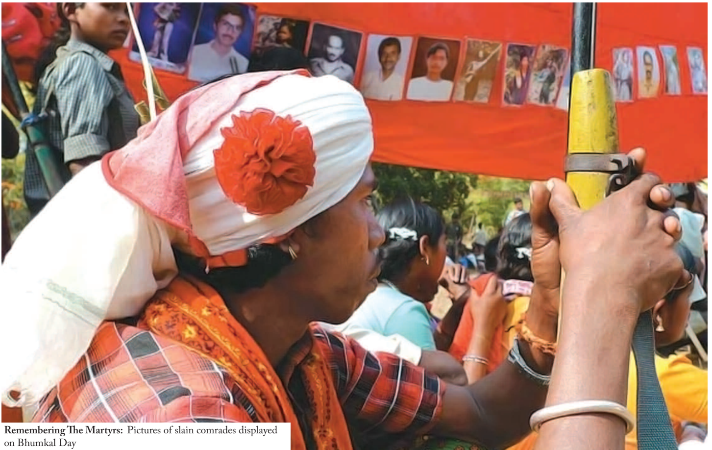
Remembering The Martyrs: Pictures of slain comrades displayed on Bhumkal Day