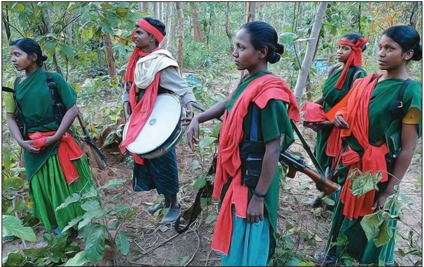
Performing Arts: Members of the Chetna Natya Manch, the cultural wing of the party, waiting in the wings

People will walk for miles, for days together to feast and sing, to put feathers in their turbans and flowers in their hair, to put their arms around each other and drink mahua and dance through the night. No one sings or dances alone. This, more than anything else, signals their defiance towards a civilisation that seeks to annihilate them.